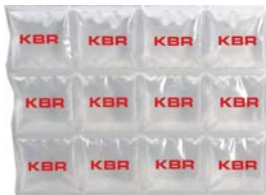
# 61680 6" x 8"