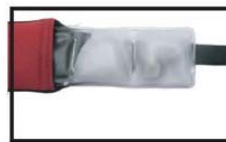
To activate heat press silver disc firmly.

To Recharge Heat Insert: Place in Boiling water for 2-3 minutes until Insert is liquid and clear.