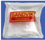
# 60100 2" x 2"