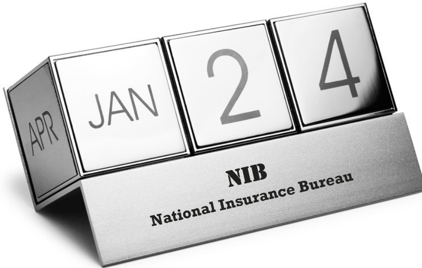
2-Sided Month Panel