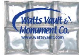
# 61460 4" x 6"