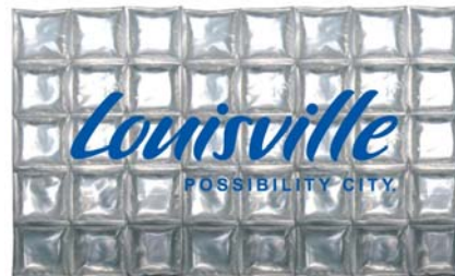
# 61016 10" x 16"