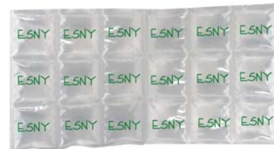
# 61612 6" x 12"