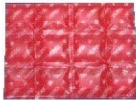
# 61680 6" x 8"