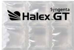
# 61460 4" x 6"